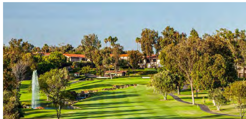
Rancho Bernardo Inn

Maybe this is the real question – Do you want to get off the roller coaster for a week of learning and relaxation? We have no doubt the answer is a resounding "YES" and we have the perfect opportunity for you to do so.